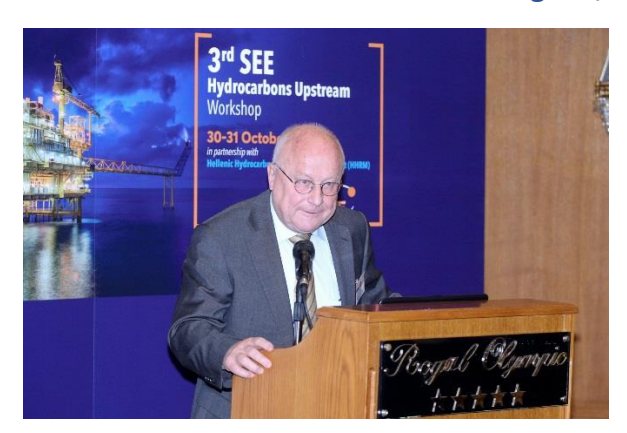
Session II: The Black Sea- Bulgaria, Romania, Georgia and Turkey