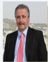
Mr. IOANNIS MANIATIS Minister Ministry of Environment, Energy & Climate Change Greece