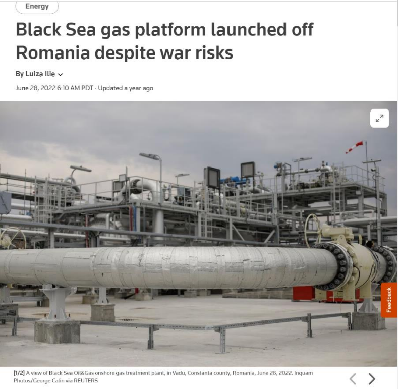
[1/2] A view of Black Sea Oil&Gas onshore gas treatment plant, in Vadu, Constanta county, Romania, June 28, 2022.