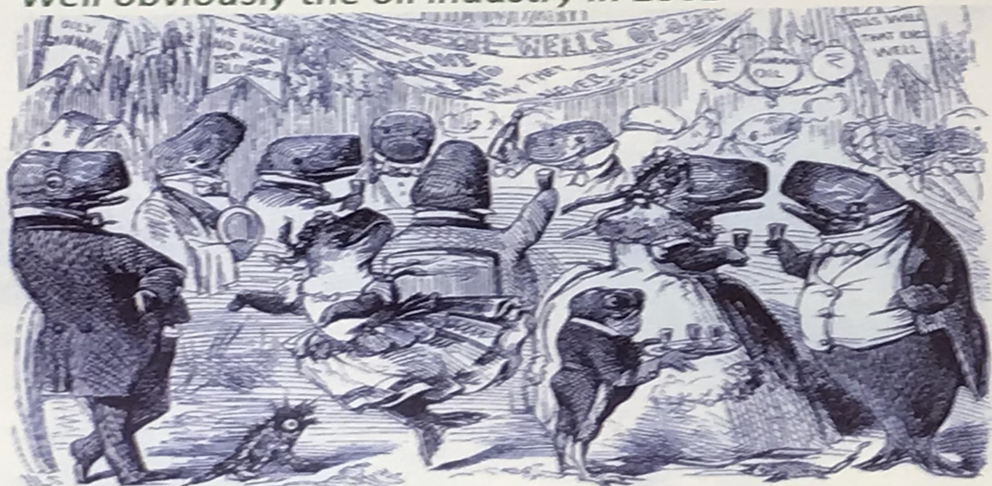
GRAND BALL GIVEN BY THE WHALES IN HONOR OF THE DISCOVERY OF THE OIL WELLS IN PENNSYLVANIA.

Reference: Vanity Fair cartoon from 1861 "Grand ball given by the whales in honor of the discovery of the oil wells in Pennsylvania."