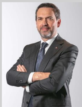
Dr. Alparслан Bayraktar, Minister of the Türkiye Ministry of Energy and Natural Resources Türkiye