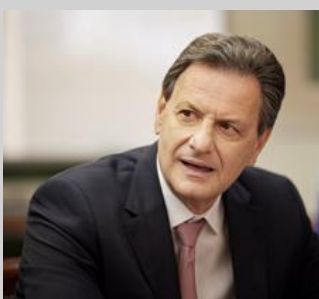
Mr. Theodore Skylakakis Minister of the Greek Ministry of Environment and Energy Greece