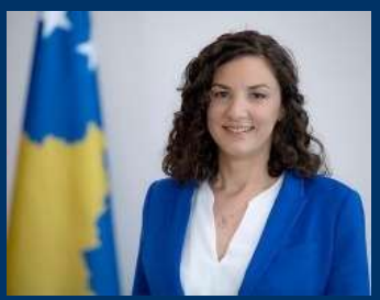
Dr. Artane Rizvanolli Minister of Economy Pristina