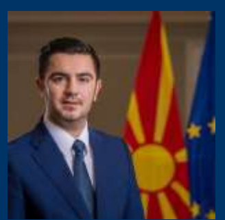
Mr. Kreshnik Bektesh Minister of Economy Skopje