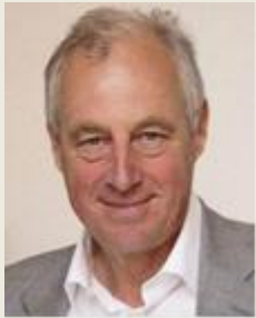
Mr. Tim Yeo Chairman The New Nuclear Watch Institute (NNWI) London, UK