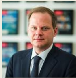
Mr. Kostas Karamanlis Minister Ministry of Infrastructure and Transport Greece