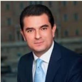
Mr. Konstantinos Skrekas Minister of Ministry of Environment & Energy Greece