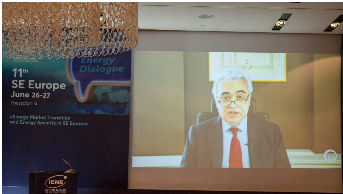
Video Message by Dr. Fatih Birol , Executive Director, International Energy Agency, Paris