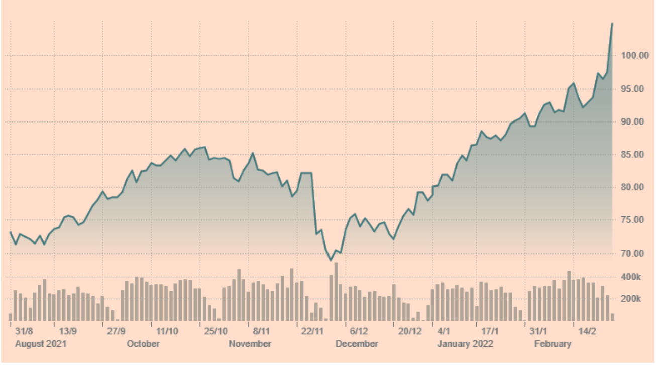
ICE Brent Crude Oil (31 August 2021 – 24 February 2022)

Nevertheless, traders were spooked by the invasion. European natural gas rose as much as 62% as the market feared supply would suffer. On Thursday (24/2) future gas contracts at TTF jumped to €143/MWh and then were traded mostly at €130/MWh, only to fall back the next day at €110/MWh. On Friday afternoon they were reported at €98.5/MWh. The Ukraine is a