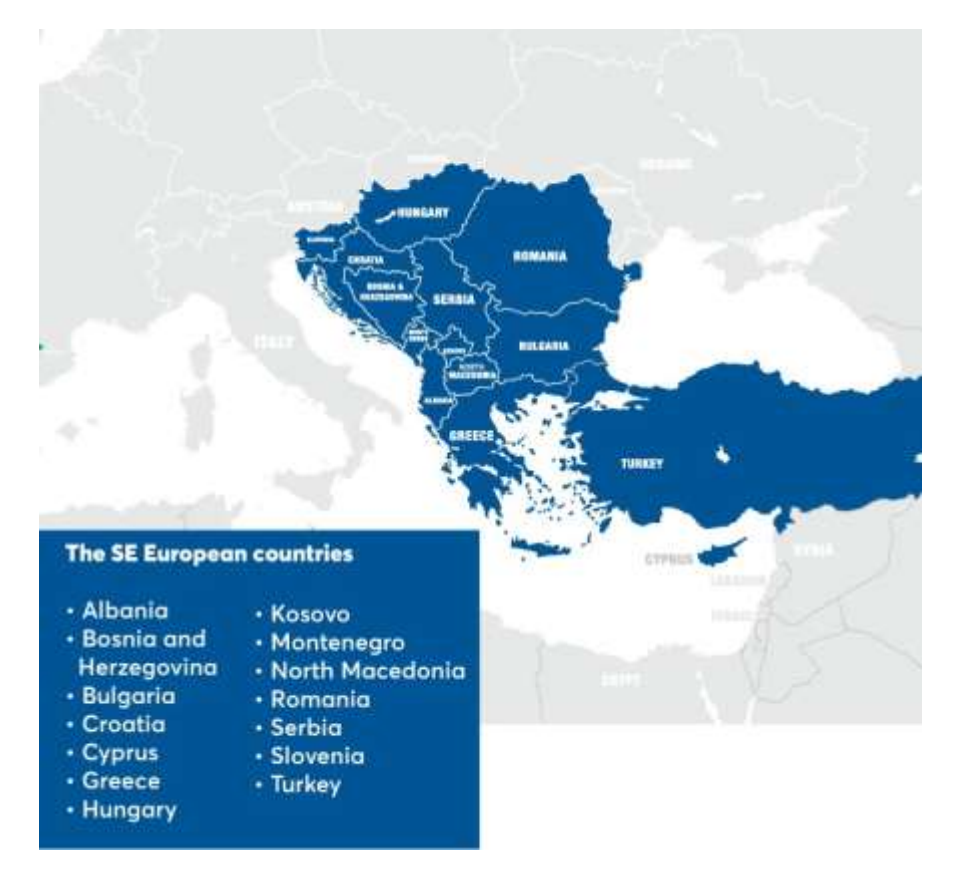
Map 1: The SE European Region as Defined by IENE

The regional gas markets are immature compared with the northwest European gas markets, which were rapidly liberalising. Gas consumption in the region has been resilient through the pandemic period. It dipped in 2019, but then grew in both 2020 and 2021, before declining again in 2022. It is worth mentioning that the total SE European gas consumption, including Turkey, accounted for 23.5% of total EU-27 gas consumption in 2022, based on Eurostat's data. With the 7 EU member states in SE Europe alone accounting for 8.5% of total EU-27 gas consumption in 2022, it comes down to basically five EU countries driving consumption in the region – Romania (10.1 bcm in 2022), Hungary (9.6 bcm in 2022), Greece (5.2 bcm in 2022), Bulgaria (2.7 bcm in 2022) and Croatia (2.5 bcm in 2022), as shown in Figure 1.