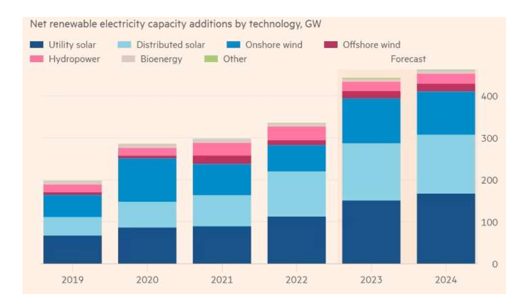
Figure 1: Global Clean Energy Additions Set for Record Highs in 2024