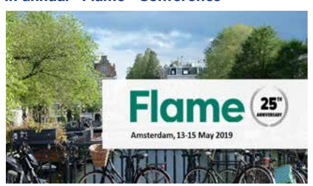
Europe's most influential natural gas event, the annual "Flame" conference was once again held at the Okura Hotel in Amsterdam from 13-15th of May.

The rebound of European gas demand, the increasingly important role that Europe is playing in global LNG trade and Russia's continuing relevance in European gas supply were dominant themes in this year's conference which brought together more than 600 senior energy executives and high level government and international organisation officials who participated in some 120 different sessions.