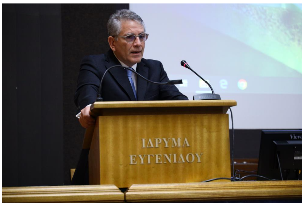
Address by the Deputy Minister of Environment & Energy in Charge of Energy and Natural Resources, Mr. Gerassimos Thomas