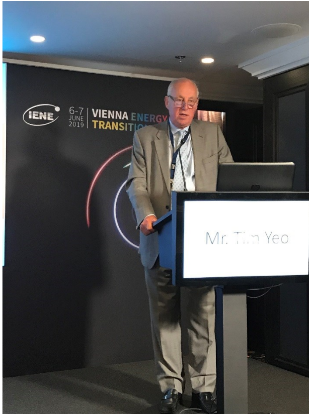
Mr. Tim Yeo, Chairman, The New Nuclear Watch Institute (NNWI), London, UK