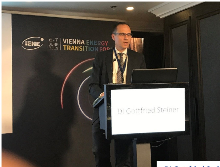
DI Gottfried Steiner , CEO Central European Gas Hub AG, Austria