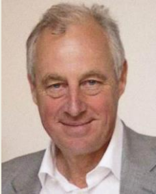
Mr. Tim Yeo Chairman of The New Nuclear Watch Institute Former UK Government Minister Energy and Climate Change consultant UK