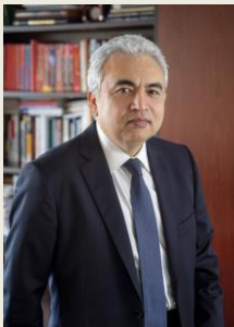
Dr. Fatih Birol Executive Director International Energy Agency Paris